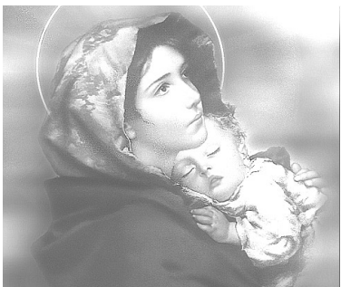
LIFE TEEN is entrusted to the heart and prayers of Our Lady.

These ministries, however, are open to anyone wanting to give their time and talent to serve God and His people. Please join us in this challenge by being a part of the LIFE Support Staff!! We need you!!